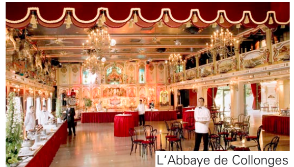
L'Abbaye de Collonges

outside of Lyon and offers a beautiful mix of tradition and modern spirit. Bocuse is a passionate collector of traditional fairground organs and he lovingly decorated the former abbey with them. Upon arrival the sound of these fairground organs greeted the 500 guests. They had a big choice of small very creative canapés – each with a different unique taste.