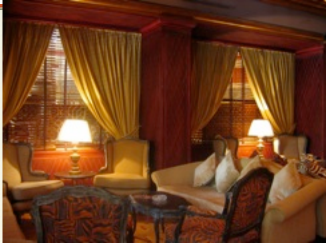
PALMERAIE GOLF PALACE THE BACCARAT BAR ....