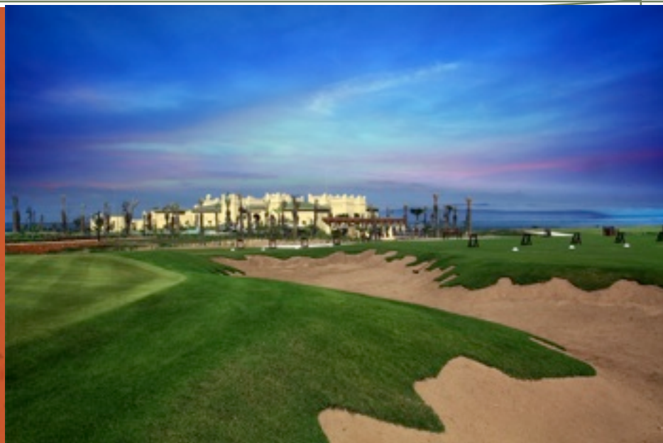
The Mazagan Beach Resort Golf in El Jadida

That could be a new «niche» of clients for which we can arrange on your behalf, VIP transfers, accommodation in all categories of hotels or riads, and any other services needed.