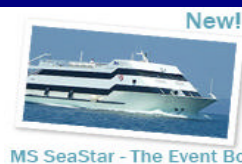
MS SeaStar - The Event Boat

We are very proud to introduce our new Croatian DMC Dubrovnik Travel to you.