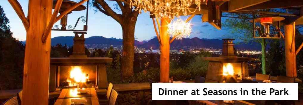
Dinner at Seasons in the Park