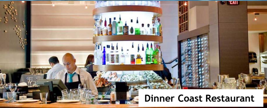
Dinner Coast Restaurant