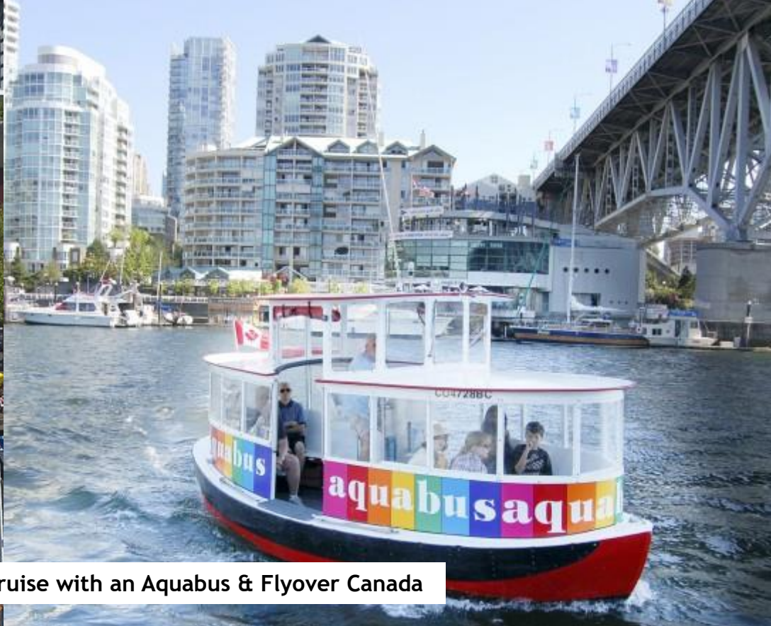
City tour in a trolley; short cruise with an Aquabus & Flyover Canada