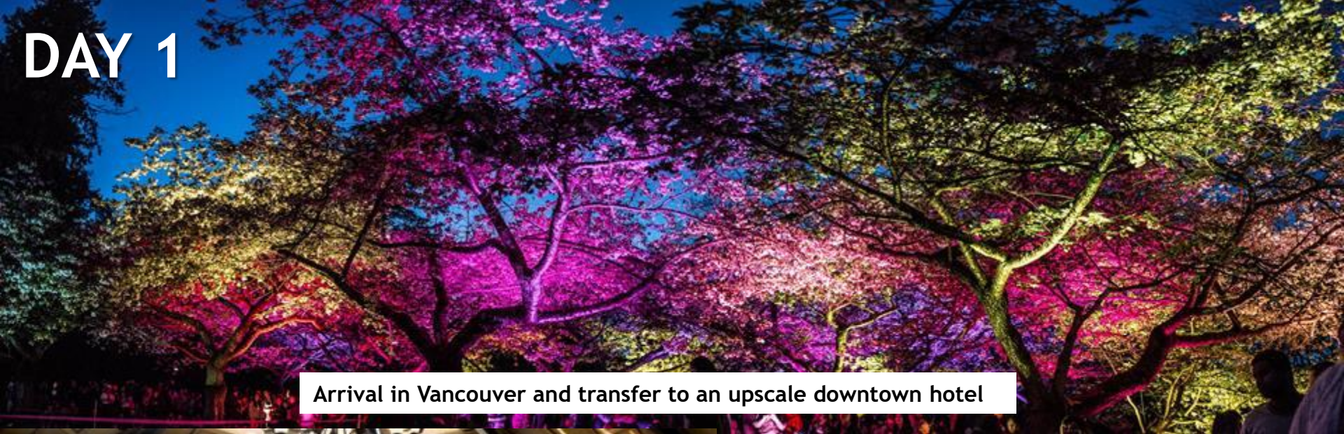
Arrival in Vancouver and transfer to an upscale downtown hotel