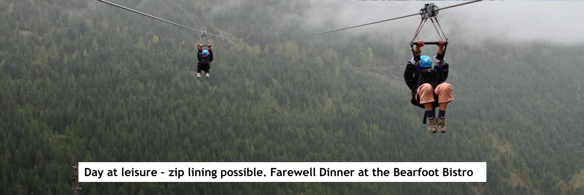
Day at leisure - zip lining possible. Farewell Dinner at the Bearfoot Bistro