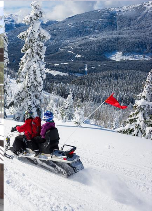
Snowmobiling and snowshoeing tour in the morning and afternoon with boxed lunch. Dinner at the Squamish Lil'wat Cultural Centre.