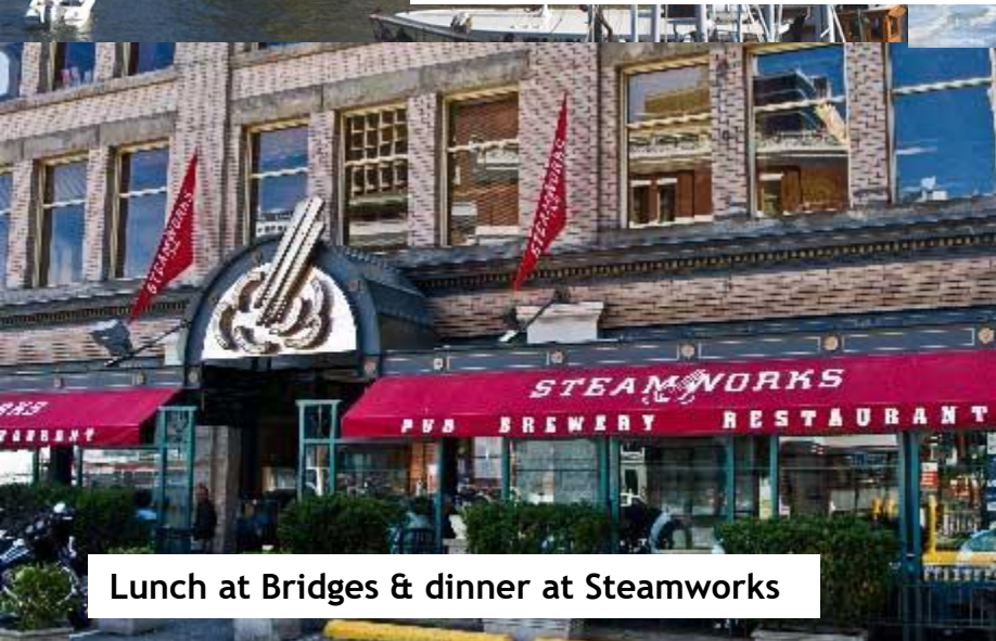
Lunch at Bridges & dinner at Steamworks