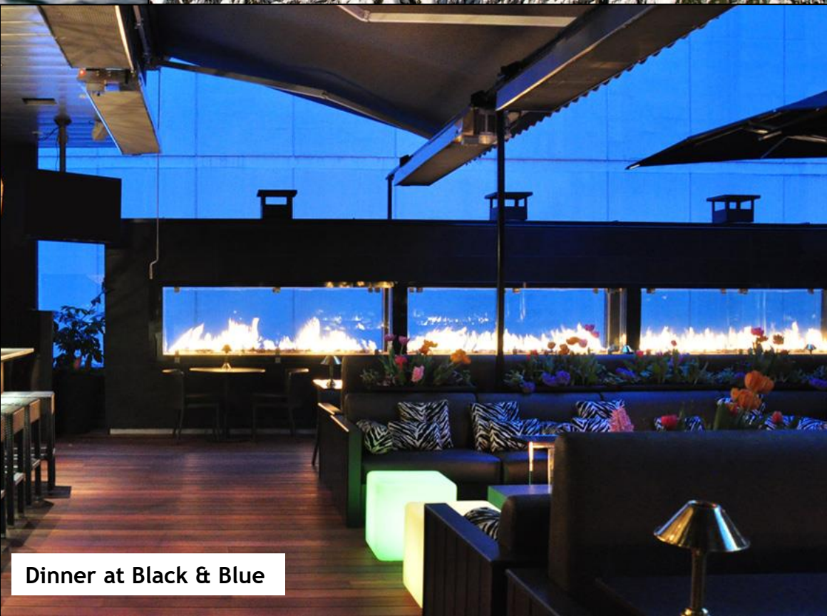
Dinner at Black & Blue