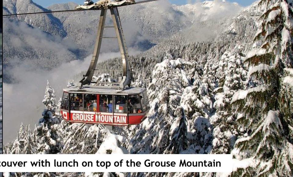
Sea Quest in Horseshoe Bay or excursion to North Vancouver with lunch on top of the Grouse Mountain