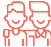
Group of all sizes