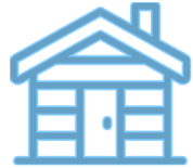
Hand Picked Accommodation