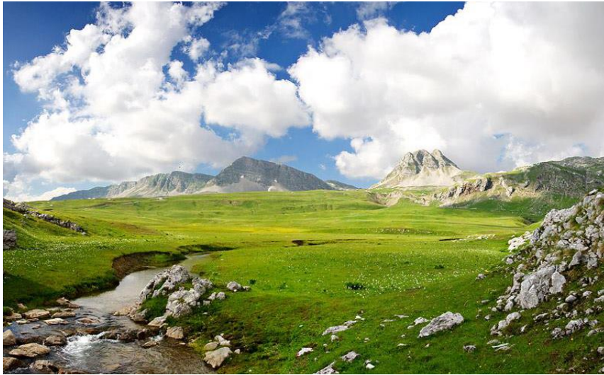
Camp near canyon Nevidio