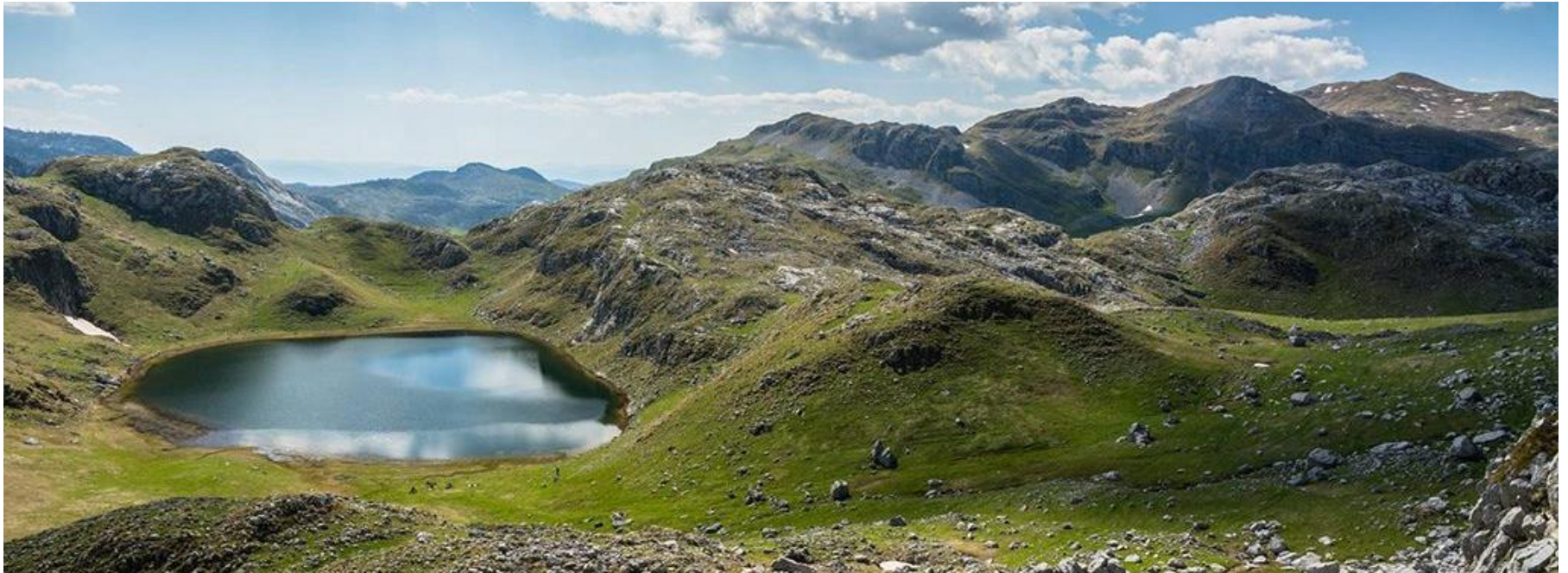
Manito Lake (Insane Lake) , beautiful lake with unusual name

Manito Lake is surrounded by grassy and partly rocky areas. It is located on 40 minutes' walk from Captain's lake, long 220 and 140 meters wide. The maximum depth is 13 meters. Clear is purely because of their inaccessibility. It has the shape of an egg, clearly edged and dark green, pure color.